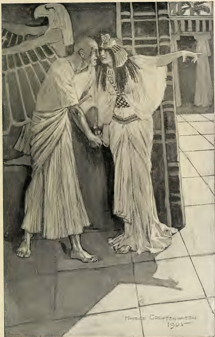
"Alone in the shadow of the Pylon."